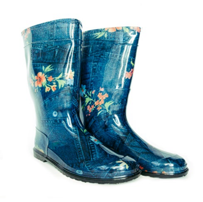
JEANS WITH FLOWERS